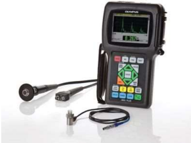
Olympus Model 38L Datalogger

Now you need another tool called MI Manager, offered by HCI Systems, Inc., http://www.hcisoftware.com/ MI Manager can import the 38DL data directly into the MI Manager database. The data can then be presented visually as shown above. Data point colors are user configurable. Material loss trends can be plotted and end-of-life projections can be assessed.